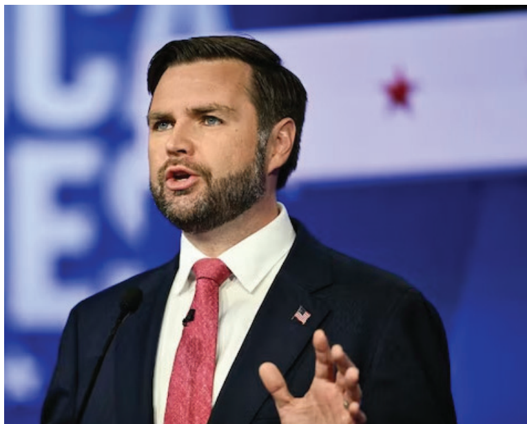
Republican vice presidential candidate JD Vance had his microphone muted by moderators during a debate with Democratic

val Governor Tim Walz after disputing a fact-check on his claims about immigration. The moment unfolded during a tense exchange about Haitian migrants in Springfield, Ohio. The debate heated up when Democratic vice-presidential nominee Tim Walz hit out at Vance, the Ohio Senator, for repeating a debunked claim that Haitian immigrants in Springfield were "eating people's pets."